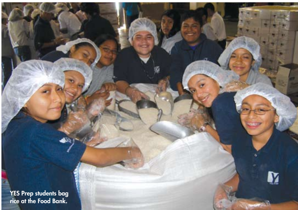
YES Prep students bag rice at the Food Bank.

We are so grateful to the students and faculty of YES Prep schools for their hard work and dedication, as well as the many other volunteers and community leaders who help make our work possible.