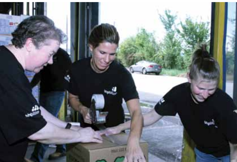
BHP Billiton employees box food for those in need.

The Houston Food Bank is privileged to have the partnership of many dedicated community organizations in the fight against hunger. One of these unique corporate partners is BHP Billiton.